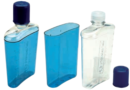
Durable polycarbonate insulation sleeve 12 ounce flask 1 ounce cap