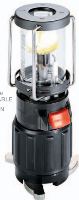
GLOBE™ REFILLABLE BUTANE LANTERN

From award winning expedition camp stoves to the most technologically advanced portable power units, we have been bringing you the finest in instruments for outdoor adventure for over 100 years.