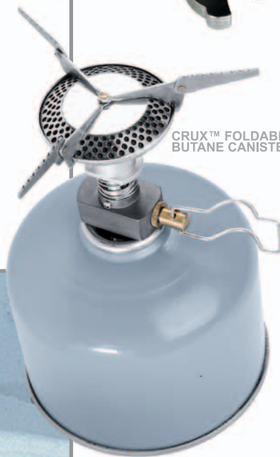
CRUX™ FOLDABLE BUTANE CANISTER STOVE