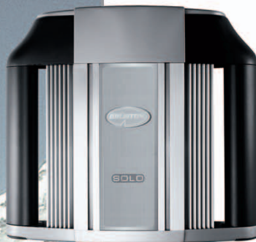
SOLO™ PORTABLE POWER PLANT