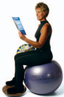
FUNctional Office Pack