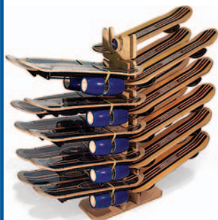
BoardRock & Bongo Board retail stand