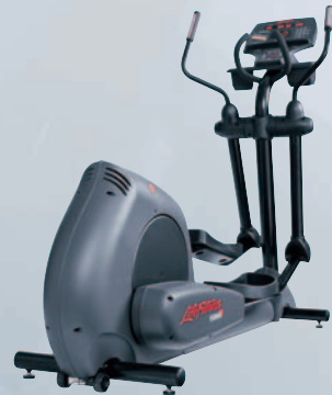
— CROSS-TRAINERS —