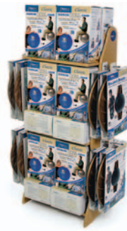
Classic Ball retail shelf