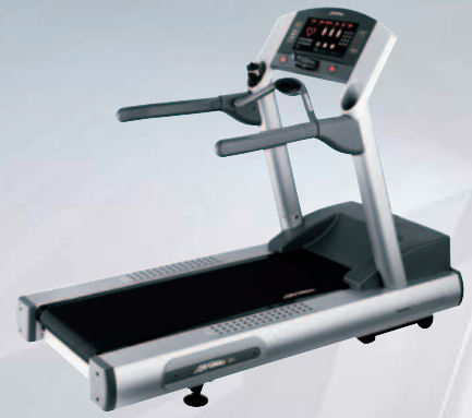
— TREADMILLS —