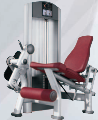
— SIGNATURE SERIES —